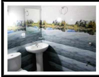
After the renovation