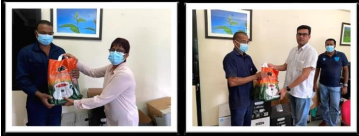
Providing dry ration to manual grade employees during the curfew in Covid pandemic