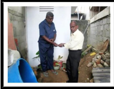
Prior to renovation