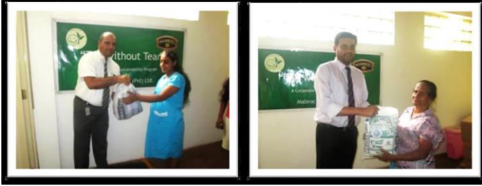
Donation of books to Mabroc manual grade staff